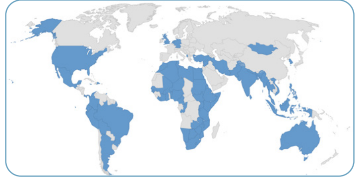
Map of selected participants' home countries for 2021

The first courses of the CASTT Adaptation Academy took place in a condensed, online format due to COVID-19 in September and October 2021. Interest and early feedback indicate a vital need for even more in-depth training on the course topics introduced.